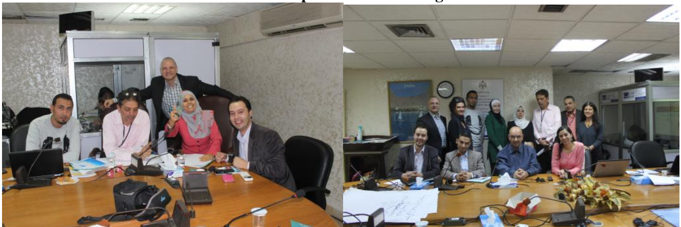
Participants of the training

Consultant's observation is that the Jordanian GBD and Ministry of finance have the capacity, understanding and knowledge to have a MYR prepared and disseminated in accordance with the OBI survey. They should work more on coordination between sectors and to prepare MYR that is readable and reachable to as large as possible share of citizens in Jordan. MF already prepares Monthly Financial Outlooks-MFO that have a lot of information that can be used in their future MYR and this MFO can serve as a good starting base to prepare proper MYR.